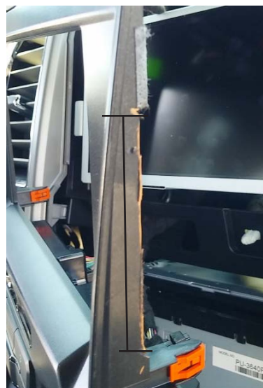
See Marked Cutout Location