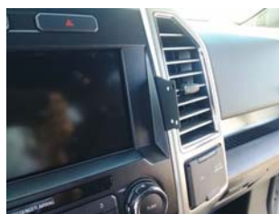
Bottom Part Installed