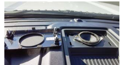
Top speaker cover bezel

INSTALLATION IS NOW COMPLETE. ENJOY YOUR NEW INDASH by PANAVISE MOUNT.