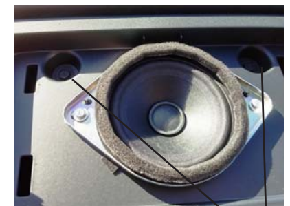
Front of speaker screw location